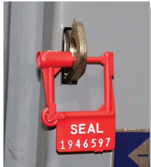
Seals shown not actual size.